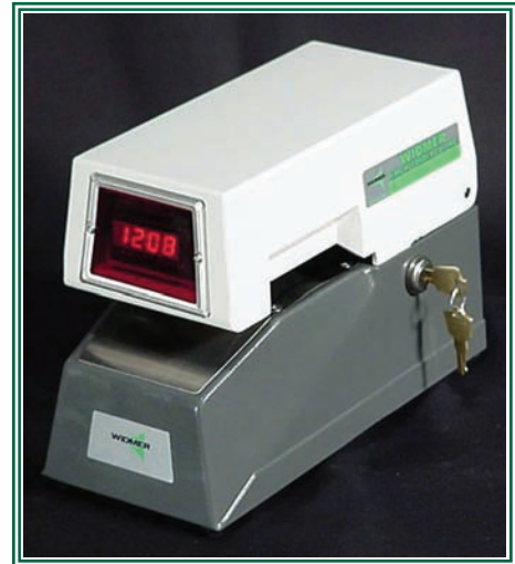
Mfg. Hackensack, NJ, USA Model T-3 available without digital display

Throat depth, standard 1-7/16", 3.7 cm, to 2", 5.1cm, optional minimum 1/8", 3.2 mm, maximum 2-3/8", 60 mm.