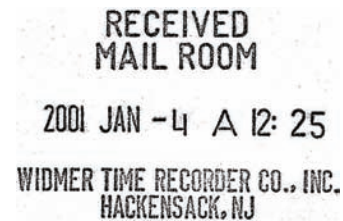
Sample impression is not full size, print area is approximately 2" by 2"